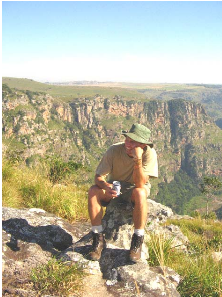
Windhoek on the edge

It was a great day, reminding us that as much as we love the Deep South, we do miss ArcSoc, the talks, the outings, but particularly the like-minded people.