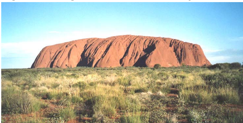
Uluru or Ayers Rock

Modern day Australians of Aborigine origin live in the vicinity of the rock and are responsible for its preservation and tourism management. Some portions of the Rock are 'out-of-