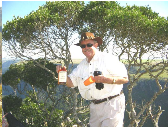
Brandewyn & coke on the edge