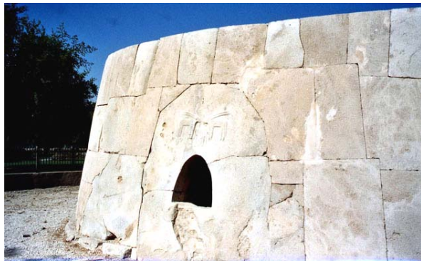
Great Hilli Tomb

of extremely well block-crafted and fitted limestone blocks. An excellently realistic pair of ibexes are carved on the block above the small mud-height entrance opening into the structure. Other similar cut block structures are either round, or rectangular, one round are having several rooms and an internal well. Very realistic leopards are sculpted on either side of the doorway to one of the structures. Usually only the foundations of the structures are present, but they are restored as far as it is possible to do so with the superstructure blocks which continue to be on each individual site. A considerable amount of human remains has been excavated on the site, on which excavations by the French continue each winter. Most of this site is located within an excellently maintained green-grassed and tree-d 'Archaeological Park' under the control of the Museum which is well used recreational purposes.