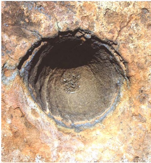
Cupule on Machete Hill

incoming farmers appropriated this idea from the locals, and shows a possible merging of certain elements of the spiritual worlds of the different groups in the SLC.